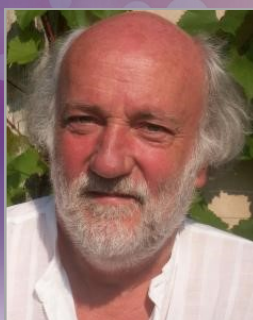
Geoff Petty Creativity Assessment Evidence-Based TLA Embedding English